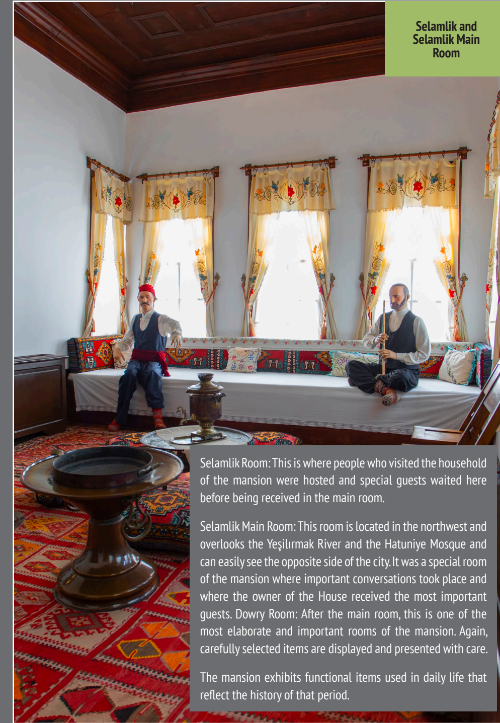
Selamlık and Selamlık Main Room

Selamlık Room: This is where people who visited the household of the mansion were hosted and special guests waited here before being received in the main room.